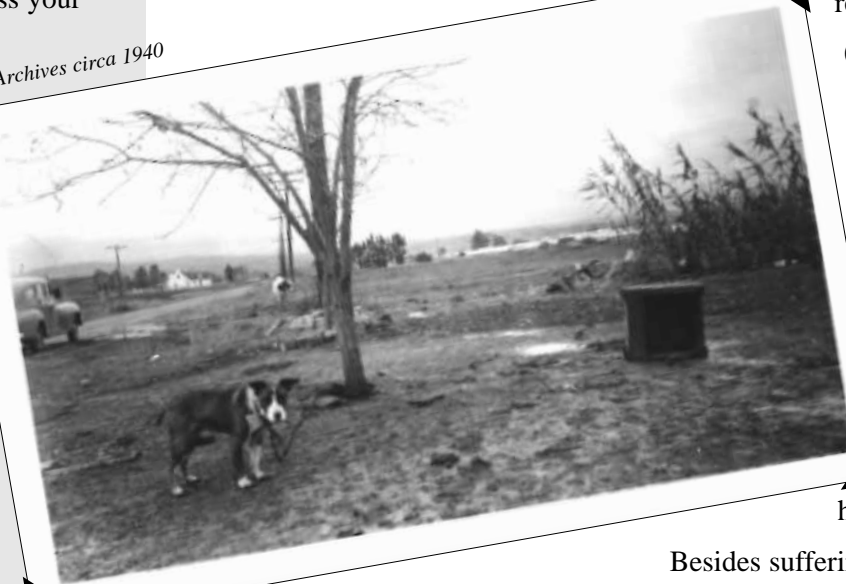
PAHS Archives circa 1940

shelter in a safe secure den—our homes—and they want to go outside to relieve themselves. Because of the need to socialize and the need for a den, keeping a dog isolated in a backyard goes against a dog's most basic instincts.